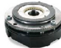
INTORQ BFK458-L LongLife Spring-applied Brake