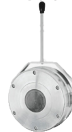
INTORQ BFK471 Spring-applied Brake