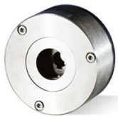
INTORQ BFK461 Spring-applied Brake