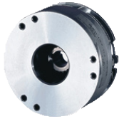
INTORQ BFK457 Spring-applied Brake

We now supply the complete range of Intorq Motor brakes and Components. We stock all sizes including spare parts. The Intorq motor brakes are made to suit all major electric motor manufactures specifications. Customisation available.