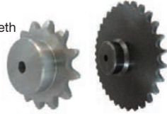
Ground Specification Welded Specification